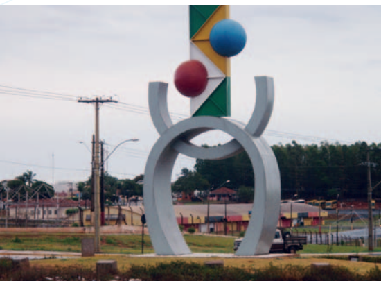
Entering Bastos is a sculpture reflecting the Japanese-Brazilian flavor of the town and the shape of its main product

The town of Bastos located in Sao Paulo State, Brazil can truly be characterized as an egg production powerhouse. Although Bastos has a human population of just 20,000, the surrounding area is home to an enormous 21 million commercial layers or approximately 25 % of the entire Brazilian layer flock. To express it differently, if Bastos was a state in the USA it would rank fifth among all states in egg production!